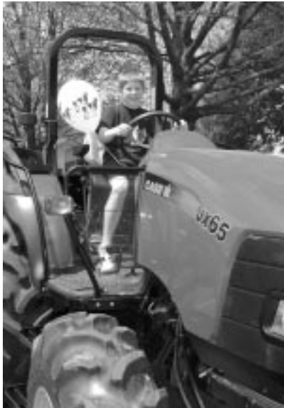
A young visitor enjoys the driver's seat of one of the tractors on display.

Despite predictions of rain and cold, the Spring Farm Day, May 3, turned out to be a sunny and warm Saturday. It was a good day for the neighboring farmers as well as the hundreds of residents, family members and guests who ventured outdoors to enjoy the festivities.