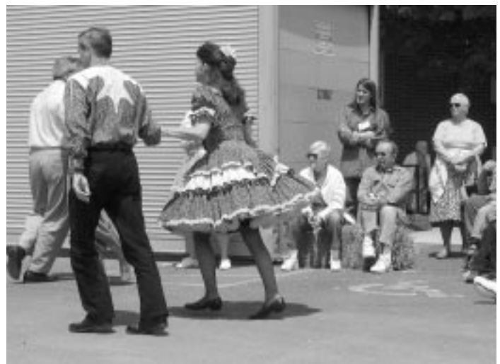
Persons enjoy watching the square dancers.