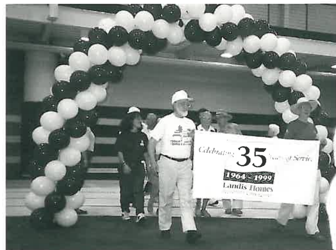
Residents carry the Landis Homes 35 th Anniversary banner into the Opening Ceremonies at Senior Games in June.