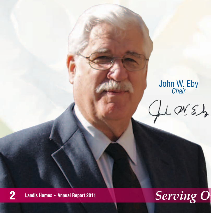
John W. Eby Chair